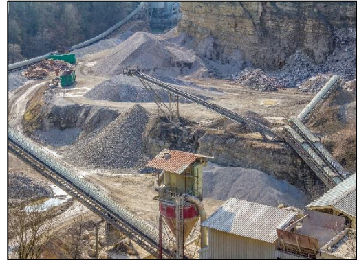
Aggregate- Sand & Gravel

A 2000 ft Overland Conveyor system carrying pre-crushed 15" minus rock from the quarry to the primary crushing circuit required costly component replacement. The lengthy belt consistently incurred damage, and the “other brand” pulley angled wing surfaces were worn beyond use within 7 months. Both the belt and the competitor’s pulley were being replaced frequently.